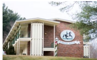
Country Lodge 63 Guest Rooms