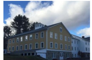
Tillyer House 28 Guest Rooms

Through the years, this historical destination has grown into a landmark in Sturbridge, Massachusetts, offering two charming restaurants that boast a dining experience from an era that has long passed with post-beam ceilings and old-fashioned fireplaces. We have 128 guest rooms with your choice of four lodging facilities all in a historical setting with private baths and air conditioning. The Historic Inn has 17 country guest rooms each with their own 18 th century décor, our renovated and expanded Chamberlain House now has 12 suites and 8 guest rooms, our newly built Tillyer House has 28 guests rooms, day spa and salon, and fitness room, and the Country Lodge has 63 guest rooms nestled on the hill with an outdoor pool!