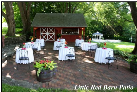
Little Red Barn Patio