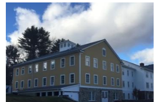
Tillyer House 28 Guest Rooms

Through the years, this historical destination has grown into a landmark in Sturbridge, Massachusetts, offering two charming restaurants that boast a dining experience from an era that has long passed with post-beam ceilings and old-fashioned fireplaces. We have 128 guest rooms with your choice of four lodging facilities all in a historical setting with private baths and air conditioning. The Historic Inn has 17 country guest rooms each with their own 18 th century décor, our renovated and expanded Chamberlain House now has 12 suites and 8 guest rooms, our newly built Tillyer House has 28 guests rooms, day spa and salon, and fitness room, and the Country Lodge has 63 guest rooms nestled on the hill with an outdoor pool!