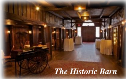
The Historic Barn