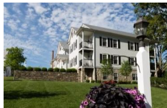
Chamberlain House 20 Guest Rooms