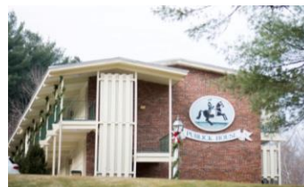
Country Lodge 63 Guest Rooms