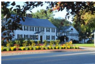
Historic Inn 17 Historic Guest Rooms

Located at the junction of I-84 and I-90 in Sturbridge, Massachusetts, the Publick House Historic Inn is just 20 minutes from Worcester, one hour from Boston & Rhode Island, and 45 minutes from Hartford.