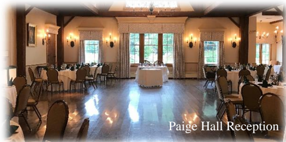
Paige Hall Reception

If weather is inclement with an outdoor location, your ceremony will be moved into Paige Hall