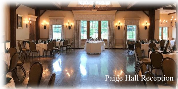
Paige Hall Reception

If weather is inclement with an outdoor location, your ceremony will be moved into Paige Hall