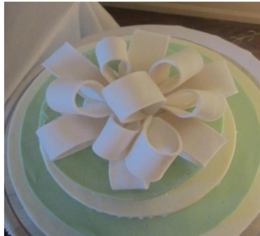
FONDANT BOW CAKE TOPPER